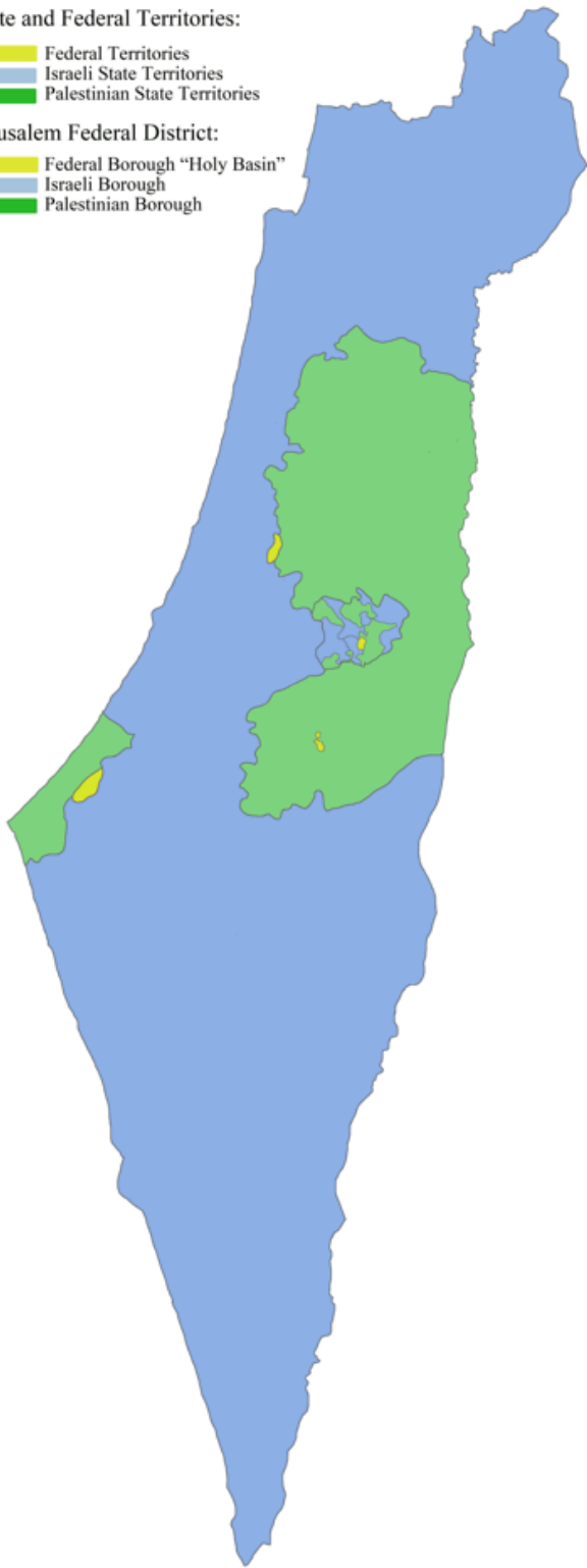
State and Federal Territories